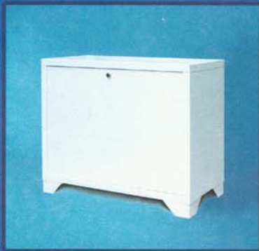
Base dimensions: 26" H x 32" W x 15" D Weight: 60 lbs.